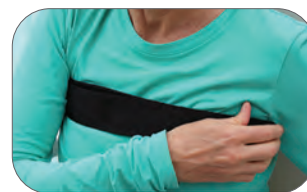
B. Stability Strap