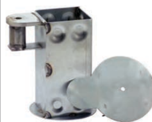
E. Deck Anchor