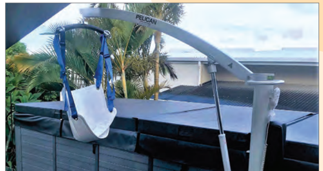
A 150kg Lift & F. Sling Attachment