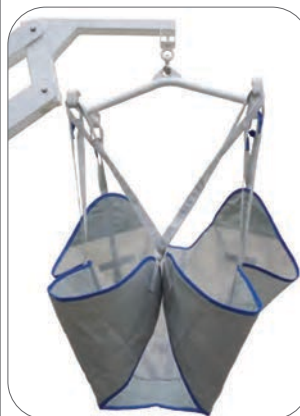
A. Sling & Jib Attachment