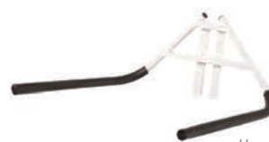
D. Spine Board Attachment