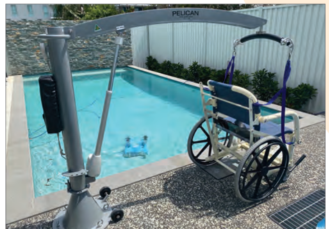
B 200kg Lift & E. 200kg Wheelchair