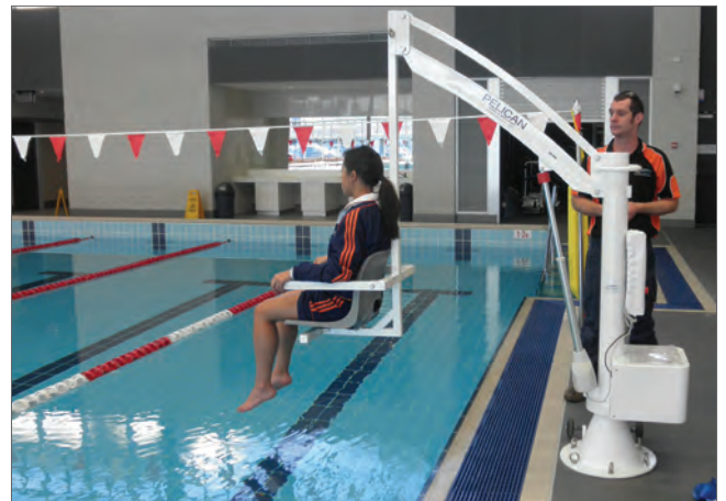
B. 200kg Lift, C. Power Rotating & G. Seat with Twin Arms