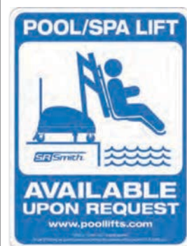
I. Lift Available On Request Sign