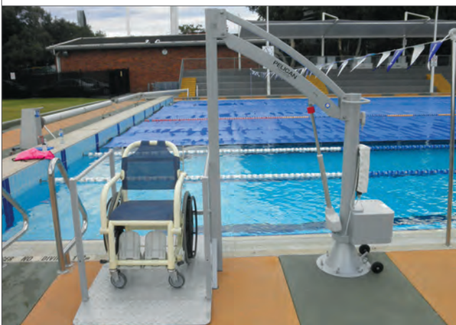
B. 200kg Lift, C. Power Rotating & J. Wheelchair Platform