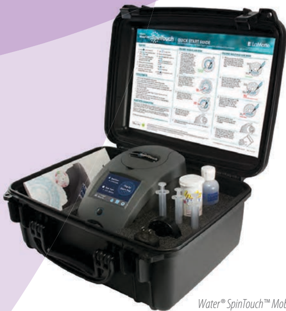
Water® SpinTouch™ Mobile