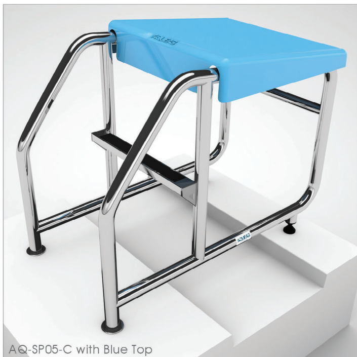
AQ-SP05-C with Blue Top