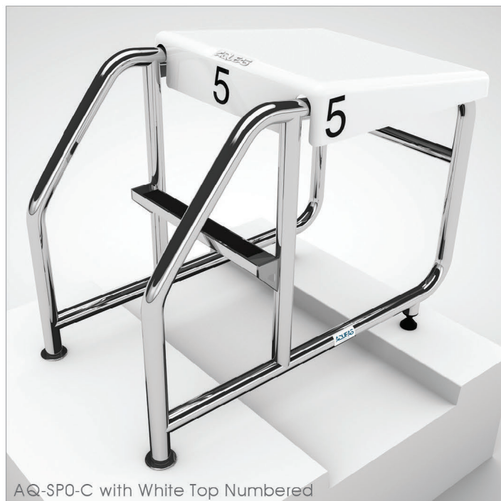
AQ-SP0-C with White Top Numbered