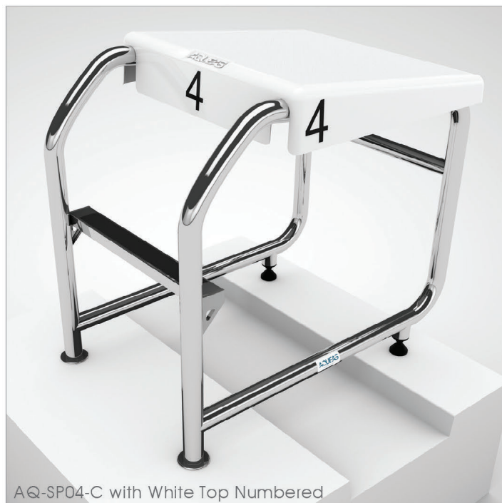
AQ-SP04-C with White Top Numbered