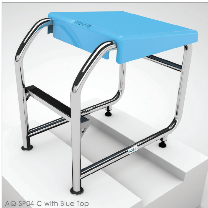
AQ-SP04-C with Blue Top