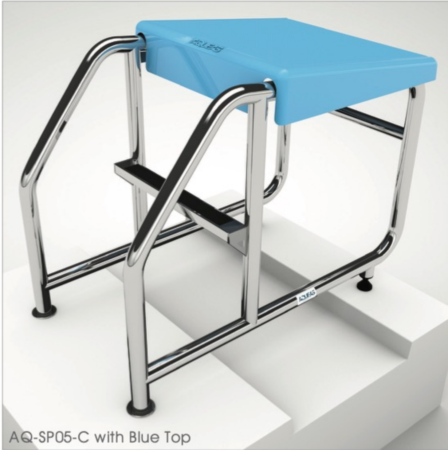
AQ-SP05-C with Blue Top