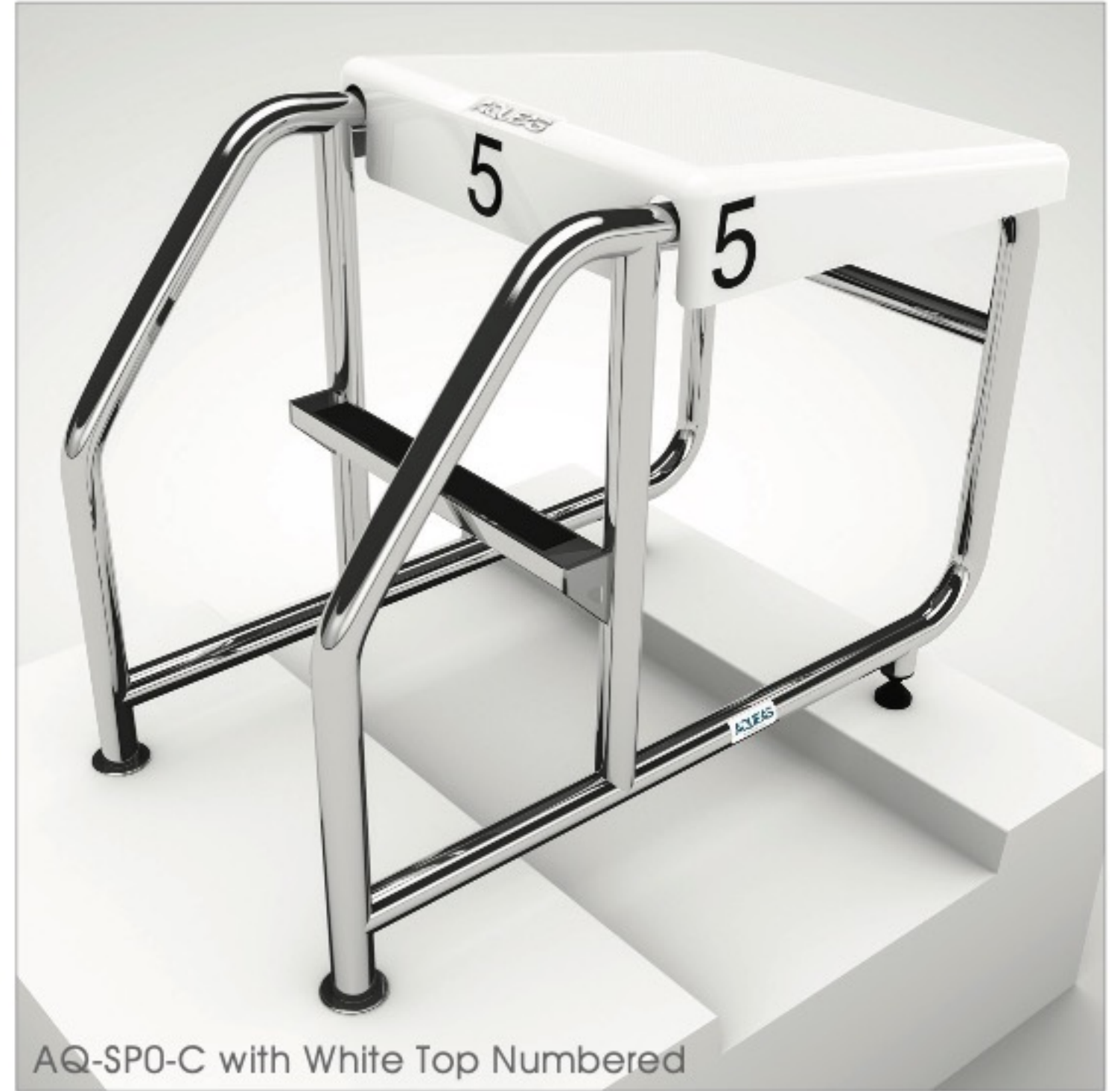
AQ-SP0-C with White Top Numbered